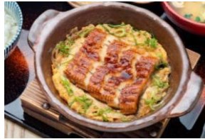
UNAGI TOJI うなぎとじ Set meal (Double) $43.00- Set meal (Single) $32.00- À la carte (Double) $39.50- À la carte (Single) $28.50-