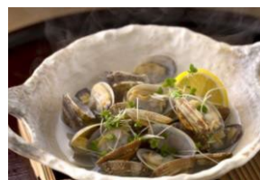
ASARI SAKAMUSHI アサリの酒蒸し $12.00-