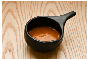
CURRY カレー $8.00-