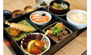
YAYOI GOZEN やよい御膳 Set meal $39.00-