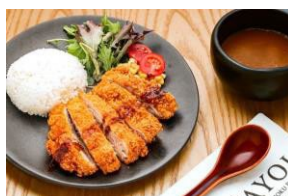
CHICKEN KATSU CURRY チキンかつカレー $28.30-