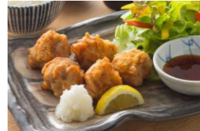
CHICKEN KARA-AGE (MILD or SPICY) 唐揚げ(ノーマル or スパイシー) Set meal $20.80- À la carte $17.30-