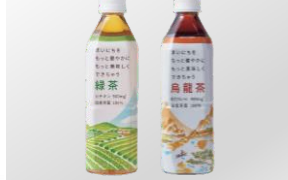
BOTTLE OF TEA ボトルティー $5.00-