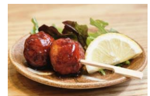
TSUKUNE MEATBALLS つくね $5.50-