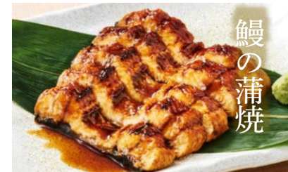
UNAGI KABAYAKI うなぎの蒲焼 $22.00-