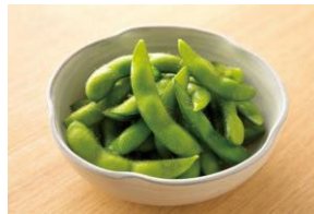
EDAMAME 枝豆 $5.00-