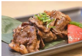
WAGYU YAKINIKU 和牛焼肉 $18.00-