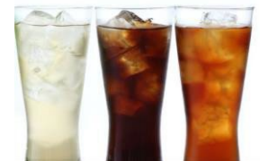
SOFT DRINKS (COKE, CALPICO etc) ソフトドリンク各種 From $4.00-