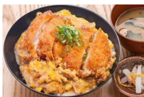
CHICKEN KATSU-TOJI DON NEW チキンかつとじ丼 $20.80-