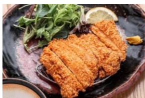
CHICKEN KATSU チキンかつ Set meal $22.80- À la carte $19.30-