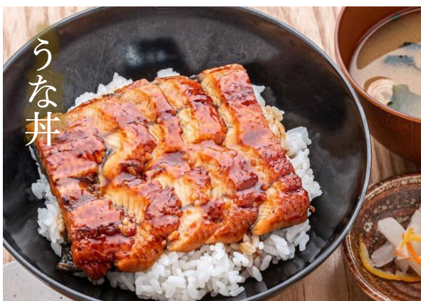
うなぎ丼 UNA DON うなぎ丼 Double $39.00- Single $28.00-