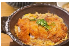
CHICKEN KATSU-TOJI NEW チキンかつとじ Set meal $23.80- À la carte $20.30-