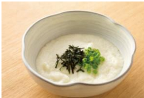
TORORO とろろ $5.00-