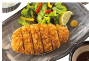
PORK LOIN KATSU ロースかつ Set meal $21.80- À la carte $18.30-