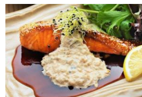
SALMON TERIYAKI サーモン照焼き Set meal $27.80- À la carte $24.30-