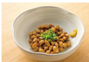
NATTO 納豆 $5.00-