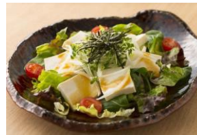
TOFU SALAD 豆腐サラダ $14.00-