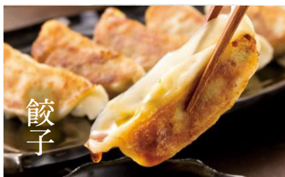
GYOZA 6 pcs 餃子 6ピース $10.00-