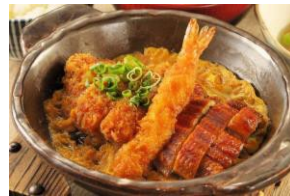
UNAGI MIX TOJI (PORK LOIN KATSU + FRIED PRAWN + UNAGI) うなぎミックスとじ Set meal $27.00- À la carte $23.50-