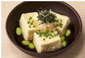
AGEDASHI TOFU 揚げ出し豆腐 $8.00-