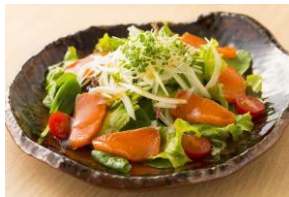
SALMON SALAD サーモンサラダ $19.00-