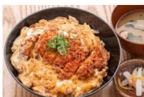
PORK LOIN KATSU-TOJI DON ロースかつとじ丼 $19.80-