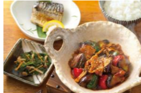
NASU MISO & SABA SHIO-YAKI 茄子味噌と鯖の塩焼き Set meal $24.80- À la carte $14.30-