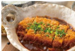
MISO PORK LOIN KATSU 味噌かつ Set meal $23.80- À la carte $20.30-