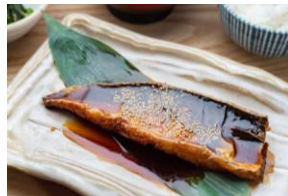
TERIYAKI SABA 照焼き鯖 Set meal $20.80- À la carte $17.30-