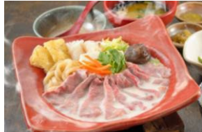
WAGYU SOY MILK HOT POT 和牛豆乳鍋 Set meal $34.00- À la carte $30.50-