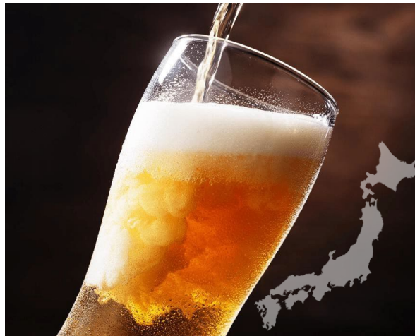
JAPANESE TAP BEER 生ビール