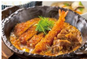
MIX TOJI (PORK KATSU + FRIED PRAWN + WAGYU) ミックスとじ(和牛) Set meal (Wagyu) $23.80- À la carte (Wagyu) $20.30-