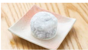
DAIFUKU MOCHI 大福餅 - SHIRO (ORIGINAL) 白 - SAKURA さくら - BLACK SESAME 黒胡麻 $4.80-