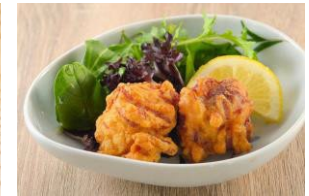
KARA-AGE 2pcs (MILD or SPICY) 唐揚げ 2ピース (ノーマルorスパイシー) $6.50-