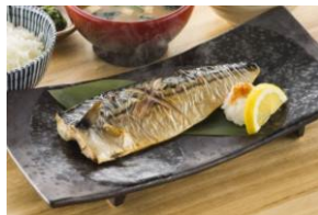
SABA SHIO-YAKI 鯖塩焼き Set meal $20.80- À la carte $17.30-