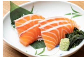
SALMON SASHIMI サーモン刺身 6pcs $18.00- 3pcs $9.00-