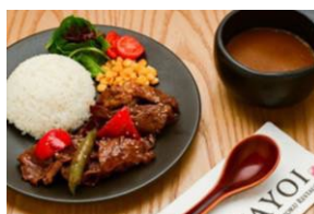
WAGYU YAKINIKU CURRY 和牛焼肉カレー $28.80-