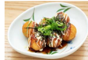
TAKOYAKI 6pcs たこ焼き 6ピース $9.00-