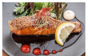
SPICY SALMON TERIYAKI スパイシーサーモン照焼き Set meal $27.80- À la carte $24.30-