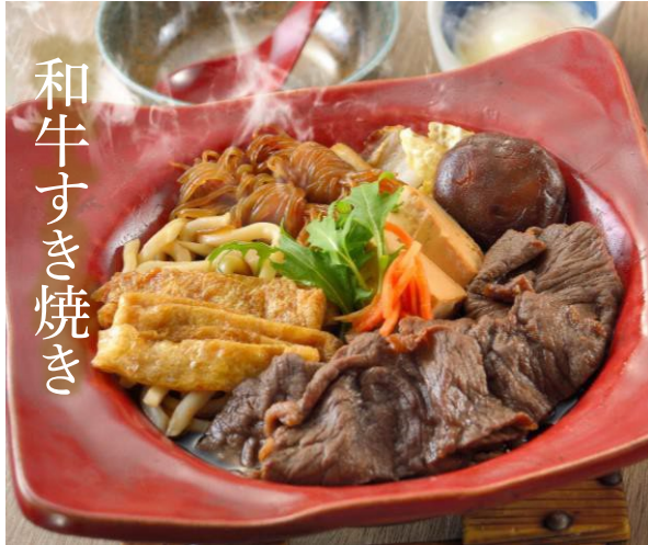
和牛すき焼き WAGYU SUKIYAKI 和牛すき焼き Set meal $34.00- À la carte $30.50-