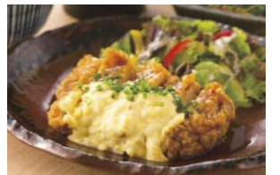
CHICKEN NAMBAN チキン南蛮 Set meal $22.80- À la carte $19.30-