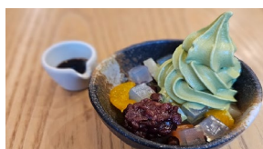
MATCHA SOFT SERVE ANMITSU 抹茶ソフトクリームあんみつ $9.50-