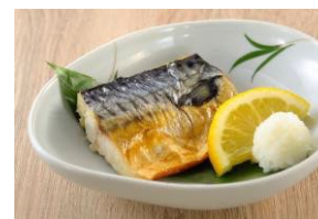
HALF SABA (SHIO-YAKI or TERIYAKI) ハーフ鯖 (塩焼きor照り焼き) $7.00-