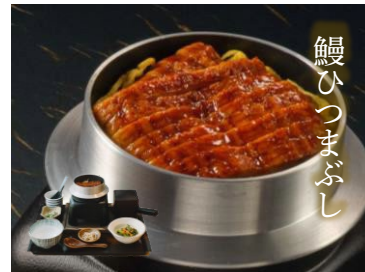
UNAGI HITSUMABUSHI うなぎひつまぶし