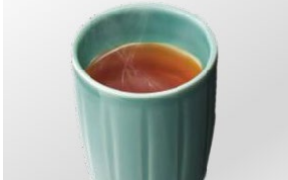
ROASTED GREEN TEA ほうじ茶 $3.00-