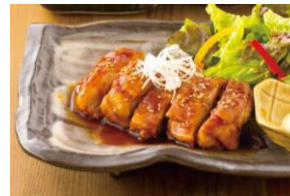
TERIYAKI CHICKEN 照焼きチキン Set meal $21.80- À la carte $18.30-