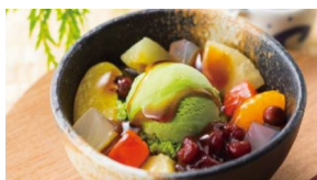
MATCHA ANMITSU 抹茶あんみつ $9.50-