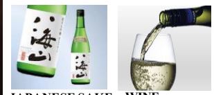
JAPANESE SAKE WINE 日本酒 ワイン