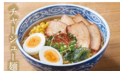
チャーシュー麺 CHASHU RAMEN チャーシュー麺 $22.80-