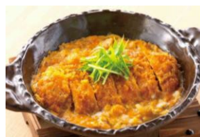
PORK LOIN KATSU-TOJI ロースかつとじ Set meal $22.80- À la carte $19.30-