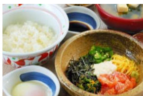
おませ丼 OMAZE DON おませ丼 $23.80-