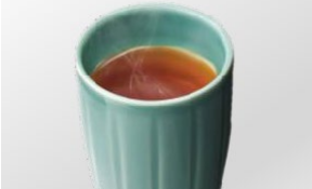
ROASTED GREEN TEA ほうじ茶 $3.00-