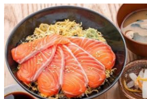
サーモン丼 SALMON DON サーモン丼 $25.50-