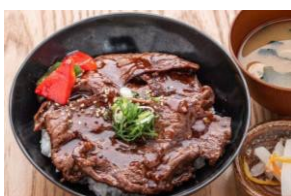
和牛焼肉丼 WAGYU YAKINIKU DON 和牛焼肉丼 $25.50- NEW Extra Wagyu +$8.00-