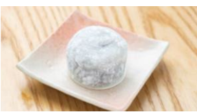
DAIFUKU MOCHI 大福餅 - SHIRO (ORIGINAL) 白 - SAKURA さくら - BLACK SESAME 黒胡麻 $4.80-