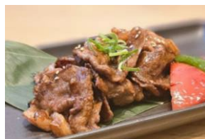
WAGYU YAKINIKU 和牛焼肉 $18.00-