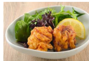
KARA-AGE 2pcs (MILD or SPICY) 唐揚げ 2ピース (ノーマルorスパイシー) $6.50-