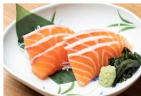
SALMON SASHIMI サーモン刺身 6pcs $18.00- 3pcs $9.00-