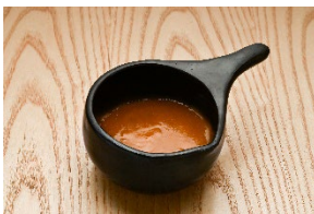
CURRY カレー $8.00-