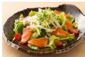
SALMON SALAD サーモンサラダ $19.00-