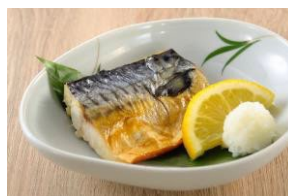
HALF SABA (SHIO-YAKI or TERIYAKI) ハーフ鯖 (塩焼きor照り焼き) $9.00-