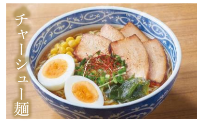
チャーシュー麺 CHASHU RAMEN チャーシュー麺 $22.80-