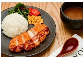
ロースかつカレー PORK LOIN KATSU CURRY ロースかつカレー $26.80-