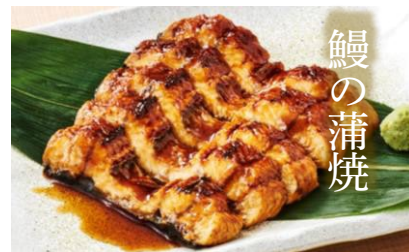
UNAGI KABAYAKI うなぎの蒲焼 $22.00-