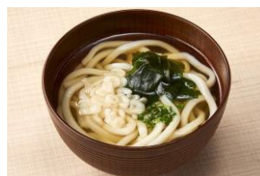
ハーフうどん HALF UDON ハーフうどん $7.00- NEW Add Wagyu +$6.00-