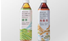
BOTTLE OF TEA ボトルティー $5.00-