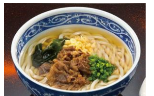
和牛肉うどん WAGYU BEEF UDON 和牛肉うどん Large $22.50- Regular $19.50- NEW Add Extra Wagyu +$6.00-