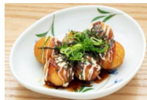
TAKOYAKI 6pcs たこ焼き 6ピース $9.00-