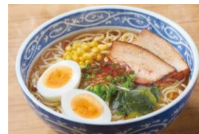
醤油ラーメン SHOYU RAMEN 醤油ラーメン $18.80-