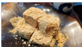
WARABI MOCHI わらび餅 - MATCHA WARABI MOCHI - KINAKO WARABI MOCHI $7.00-